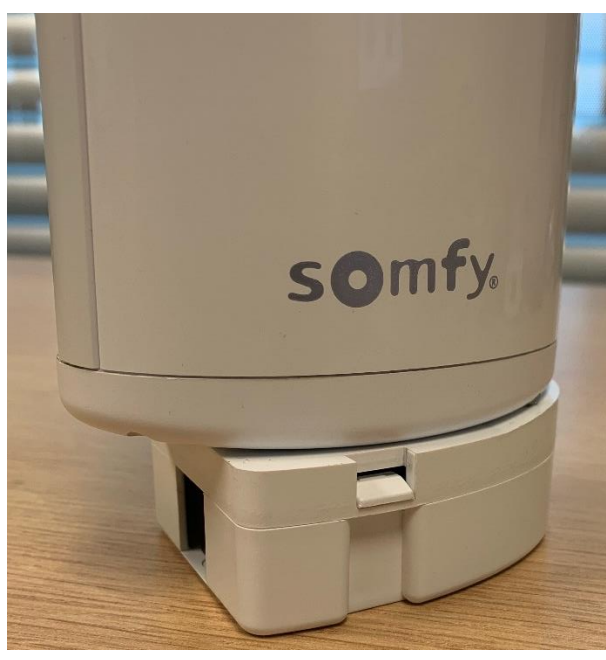
Installation is complete!