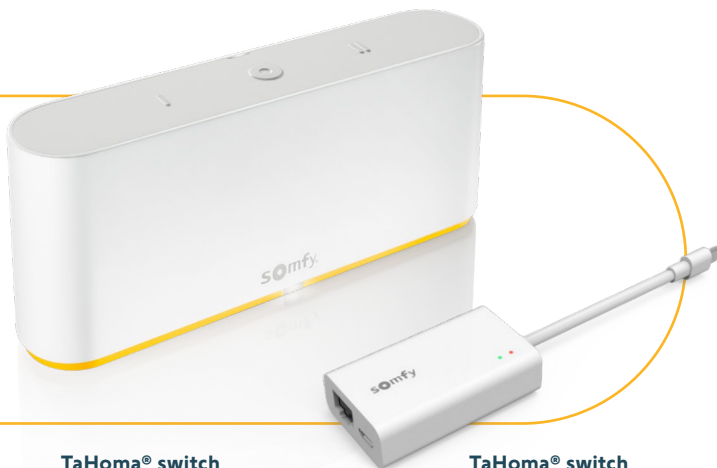
TaHoma® switch 1871037